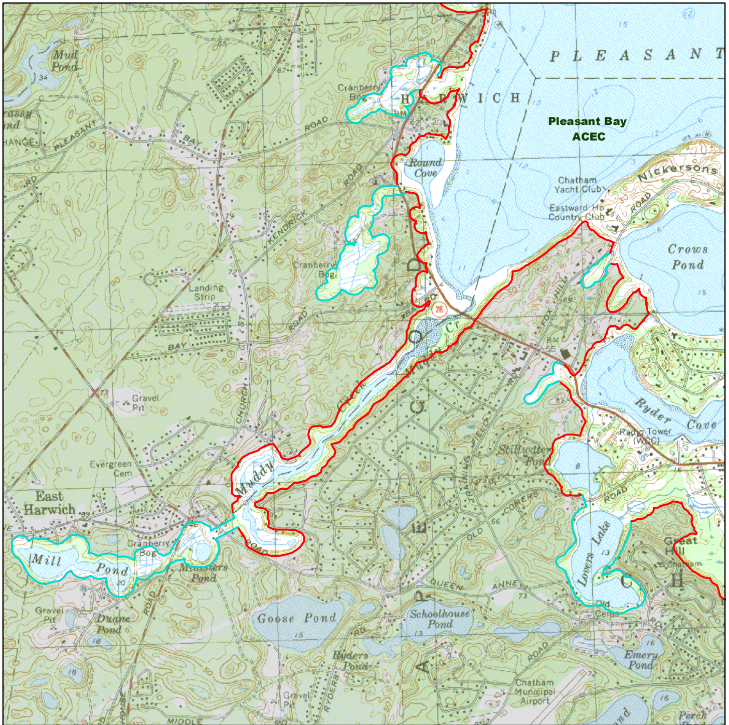
Map # 19e Pleasant Bay ACEC Map Tile 5 of 6 ACEC Designated 3/20/87 9,240 Acres