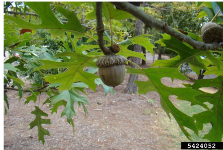
Scarlet oak leaves and acorn.

associates. A sparse subcanopy may have species of recent disturbance such as grey birch, black cherry, and sassafras, as well as species less tolerant of fire such as flowering dogwood or shadbush. Lowbush blueberries, huckleberry, and scrub oak form a low shrub layer, with scattered sheep laurel, maple-leaved viburnum, and American hazelnut. A sparse herbaceous layer includes scattered patches of Pennsylvania sedge, bracken fern, and pink lady's slipper. Wintergreen may be dense in areas with little past soil disturbance.