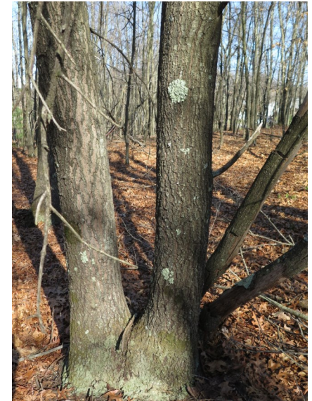
Scarlet oak in an often burned woodland.

Examples with Public Access: Salisbury Marsh WMA, Salisbury; Clinton Bluff WMA, Clinton; Green Hill Park, Worcester; Cape Cod NS, Truro.