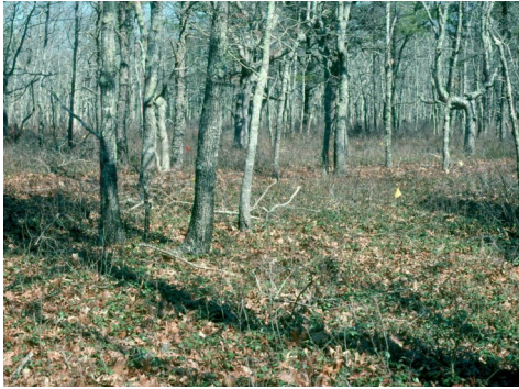
Black Oak in woodland with wintergreen showing below huckleberry layer without leaves.

Description: Black Oak - Scarlet Oak Woodland (BOSOW) is an open, short (<20m (~60 ft.)) oak/heath community maintained by regular light fire or other disturbance. The woodland occurs on dry sites, often sandy, gravelly, or rocky slopes. Without fire, a deep accumulation of oak leaf litter impedes germination of seeds that need mineral soil, restricting such species to small patches of disturbance. Except on the driest sites, without regular fire, the woodland community succeeds to more diverse, denser and taller Oak - Hemlock - White Pine Forest or one its variants.