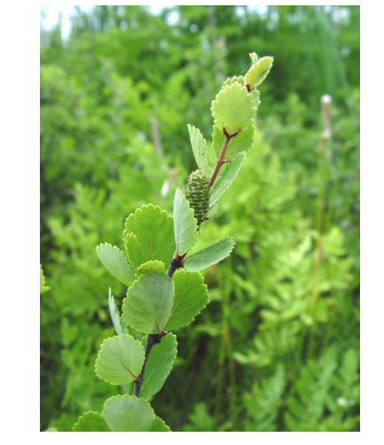
Bog birch grows at the edges of Calcareous Basin Fens.

acidic fen species such as pitcher plant, round-leaved sundew, bog rosemary, twig rush, buckbean, and large cranberry. Mosses, particularly species of sphagnum are extensive, forming the peat mat. In the wet area near the upland edge, a dense shrubby zone may include dense bog birch.