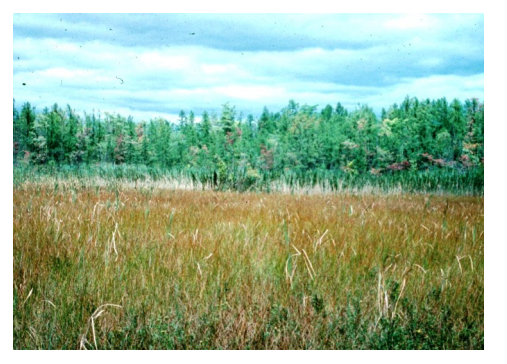
Across a Calcareous Basin Fen towards a fringe of Phragmites.

Description: <u>Calcareous Basin Fens</u> occur in well-defined basins with permanently saturated deep (>2.0 m (6.5 ft.)) peat and consolidated or floating, sedge-dominated peat mats. Waters are circumneutral to alkaline (pH 6.0-8.1) with high concentrations of calcium and magnesium cations and bicarbonate anions dissolved from bedrock or glacial materials rich in those elements. They are the least nutrient rich (with respect to water chemistry) of the calcareous fen communities.