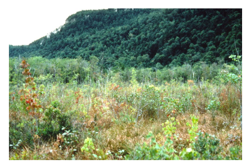
Across a shrubby Calcareous Basin Fen in a mosaic with Black Ash-Red Maple-Tamarack Calcareous Seepage Swamp.

Examples with Public Access: Due to the sensitivity of calcareous wetlands to damage from visitation, most land owners prefer not to publicize the locations.