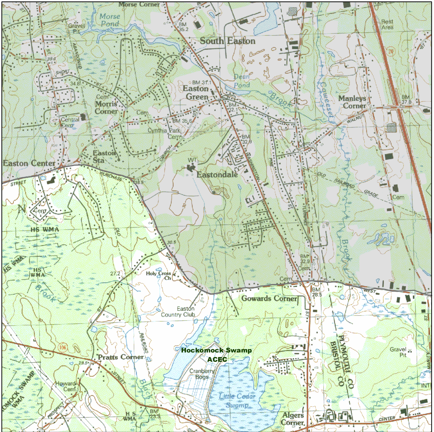
Map # 12b Hockomock Swamp ACEC Map Tile 2 of 9 ACEC Designated 2/10/90 16,960 Acres