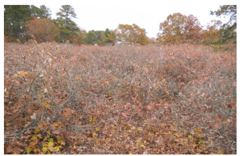
Scrub Oak Shrubland in frost pocket on sand.

Description: Scrub Oak Shrublands are dense shrublands dominated by shrub oaks forming almost impenetrable thickets ranging from 2-3 feet (~1m) to greater than 6 feet (2m) in height. They occur on sandplains, usually in depressions where localized frosts keep out competing trees, and on ridge tops. Disturbances in both environments maintain mosaics in space and time of grassland and heathland openings, shrublands, Pitch Pine - Scrub Oak Communities, and Pitch Pine - Oak Forest/Woodland. Scrub Oak Shrublands are dry with few available nutrients since sand and shallow soils on bedrock hold neither water nor nutrients. Besides frosts that damage competing tree species, fires that eliminate or significantly reduce trees establish and maintain Scrub Oak Shrublands. Because the component shrub species both foster and are adapted to fire,