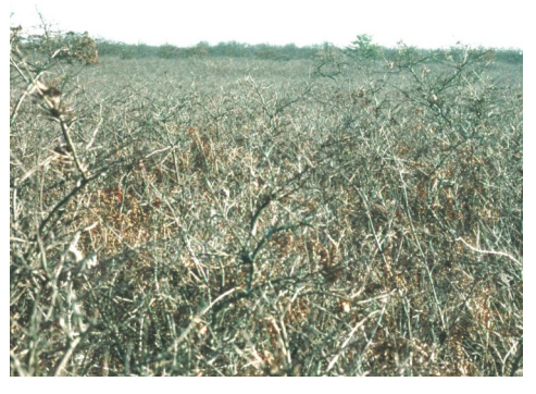
Scrub Oak Shrubland in the winter.

Examples with Public Access: Middlesex Fells, Medford; Myles Standish SF, Plymouth; Lovell's Lane Conservation Area, Mashpee; Manuel F. Correllus SF, West Tisbury.