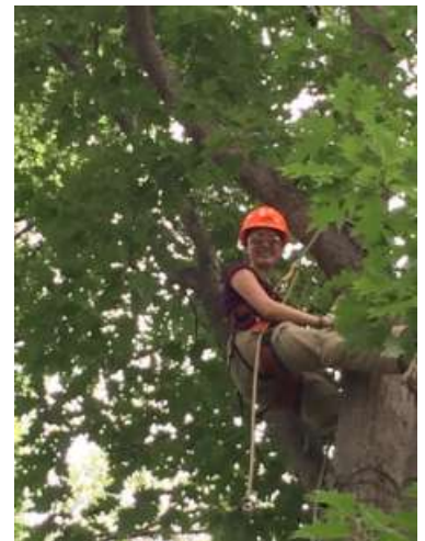
Past summer college participant.

Arborists are in great demand in many towns and cities because it is important to properly plant and maintain trees. There are currently multiple career opportunities for graduates with either a two- or a four-year degree in Arboriculture at UMass Amherst. For more information, go to: http://www.umass.edu/summer/precollege.html .