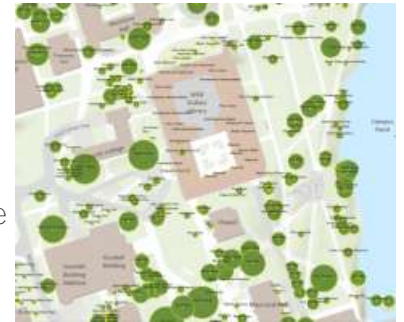
A display of campus trees from the Web application created by Todd Beals.

The person driving this ordering of data is Todd Beals, a recent Stockbridge School of Agriculture graduate who now works for the Physical Plant. Beals developed the ArcGIS Online (AGOL) Web application http://www.tiny.cc/waugharboretum , while still a graduate student. He calls it "a great outdoor textbook that anybody can access." Well, almost anybody. Built using the robust ArcGIS software, the site is rich in information, but it may not give up that information without what Beals understatedly calls, "a good bit of noodling." But it is a powerful tool for students, teachers, and the Physical Plant staff that cares for the trees. Read the full story at UMass.edu .