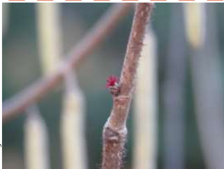
American hazelnut, Corylus americana

March 4, 2016—Researchers in the US have proposed a new form of wind power: small, artificial, mechanical trees capable of producing energy from their vibrations. Working with the natural breeze, or small movements caused by other factors, the scientists hope that new forms of renewable energy can be developed in the future. The idea is to create a device that can convert random forces – whether that's from the footfall of pedestrians on a bridge, or a passing gust of wind – into electricity that can be used to power devices. And the researchers have found that tree-like structures made from electromechanical materials are perfect for the task. Read the full story at sciencealert.com .