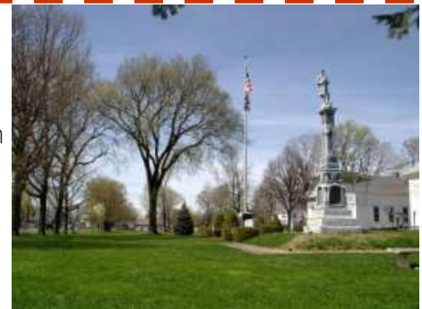
Belchertown Common.

The next application deadline is November 1, 2016.