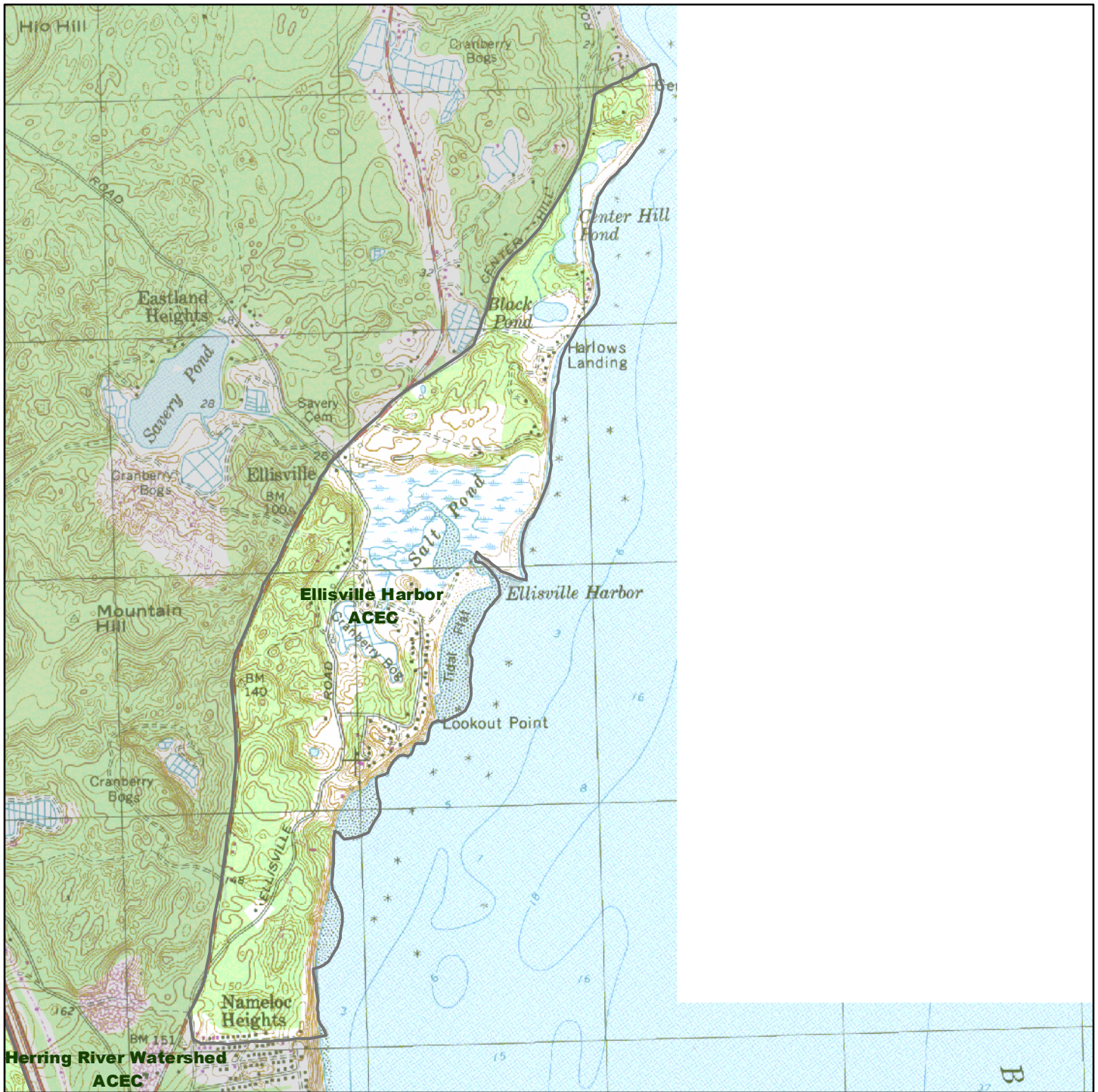
Map # 6a Ellisville Harbor ACEC Map Tile 1 of 1 ACEC Designated 1/16/80 610 Acres