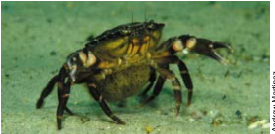
Female Carcinus maenas carrying eggs