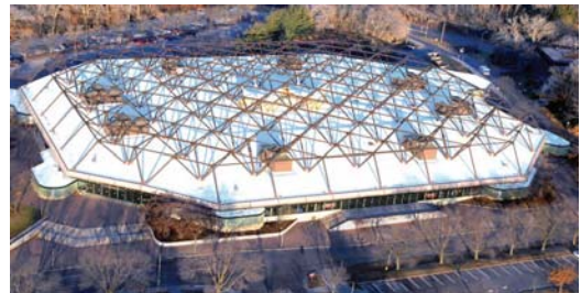
The 158,000-square-foot roofing system at the Carver-Hawkeye Arena at the University of Iowa features membrane Sika Sarnafil recycled from the old roof, which had been damaged by a severe storm.

Increasing disposal costs and the potential lost value of raw material prompted Sika Sarnafil to begin recycling trimmings from its production process during the 1990's. Initially, the trimmings were shipped to a facility in Canada for processing into roofing walkway pads. Eventually the company developed a process to reintroduce the processed material back into the membrane manufacturing system. In 2005, as volume grew, Sika Sarnafil invested in state-of-the-art grinding equipment at the Canton facility to eliminate the negative environmental impact and costs associated with the long-distance shipping related to using third-party grinders. By then a growing ethic of sustainability and increasing landfill restrictions and disposal fees helped make the case for large-scale recycling of roofs that had reached the end of their useful life. Sika Sarnafil's plan was to transport used membrane to the Canton plant, grind it to a suitable size and then add it to the manufacturing process to blend with new polymer.