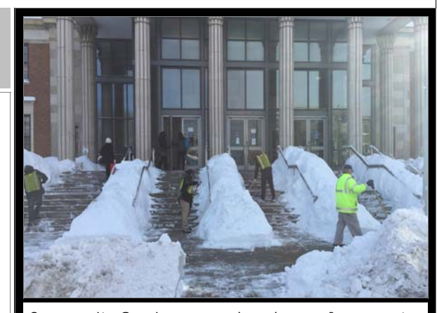
Community Service crews shovel snow from courthouse steps at Boston Municipal Court-Dorchester.

This winter, Community Service crews have also shoveled out courts, food pantries, schools, housing developments, and animal shelters.