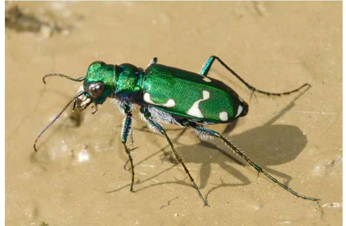
Cicindela patruela ▪ MA: Plymouth Co. ▪ 1 Sep 2005 ▪ Photo by M.W. Nelson

LIFE HISTORY: The Barrens Tiger Beetle has a two-year life cycle. Adult beetles emerge in late August and September, entering diapause by October and overwintering. The adults are active again from late April through early June, when they mate and females lay eggs. Eggs hatch soon after they are laid, and larvae feed until the fall, spending the first winter in larval diapause. Larvae resume feeding in the spring and complete