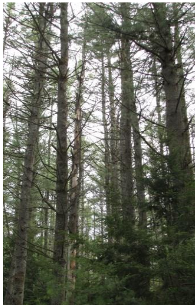
White Pine Plantation