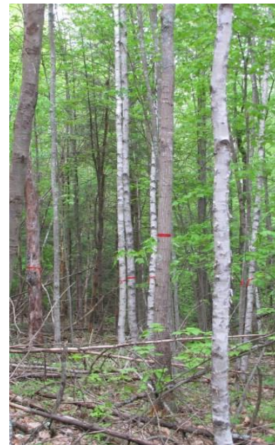
Retained Red Oak & White Birch Poles