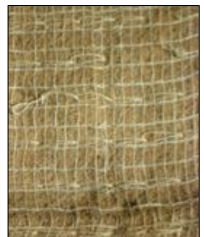
Stitched fiber blanket.