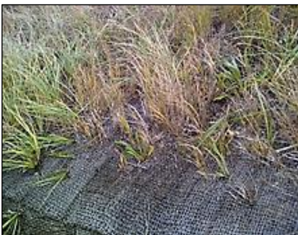
Vegetation growing up through a natural fiber blanket.

No shoreline stabilization option permanently stops all erosion or storm damage. The level of protection provided depends on the option chosen, project design, and site-specific conditions such as the exposure to storms. All options require maintenance, and many also require steps to address adverse impacts to the shoreline system, called mitigation. Some options, such as seawalls and other hard structures, are only allowed in very limited situations because of their impacts to the shoreline system. When evaluating alternatives, property owners must first determine which options are allowable under state, federal, and local regulations and then evaluate their expected level of protection, predicted lifespan, impacts, and costs of project design, installation, mitigation, and long-term maintenance.