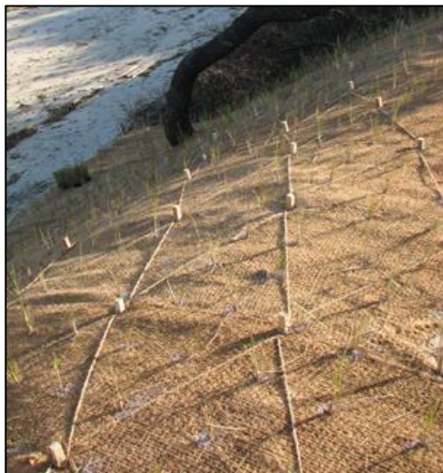
Oak stakes are used to anchor the natural fiber blanket installed on this bank. A notch in the stake is used as a stop to hold biodegradable coir twine to secure the blanket to the ground surface. Vegetation was planted through the blanket.

When natural fiber blankets are used to cover the entire slope of a bank, anchor trenches are often used. Anchor trenches are small depressions, typically 6-12 inches deep by 6-8 inches wide that are dug parallel to the shoreline. In this approach, the blankets run from an anchor trench at the top of the bank, down the bank face to another anchor trench at the bottom of the slope. The trenches are backfilled with sediments similar to those found on the bank or beach and compacted so water will flow evenly over the blanket and not under it.