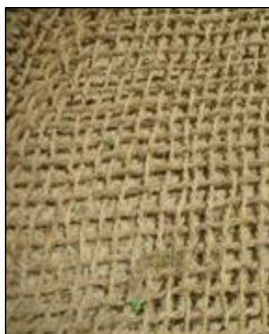
Woven coir blanket. (Photos: Coir Green “Environmentally Friendly”)