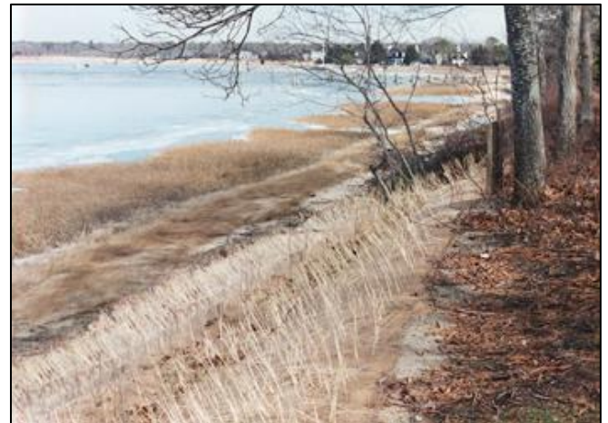
A natural fiber blanket was installed on this bank and vegetation was planted through the blanket while the plants were dormant.

Natural fiber blankets are used on non-vegetated portions of banks to prevent erosion while native salt-tolerant vegetation with extensive root systems becomes established on the site. A salt-tolerant seed mix is spread across the area before the natural fiber blanket is secured, and then live vegetation is planted through the blanket. The blanket helps hold sand, soil, and other sediments in place by protecting the surface from erosion caused by wind, salt spray, and flowing water. The seeds grow quickly and also help secure the soil surface while the larger live plants become established and begin to spread. The blanket also retains moisture to promote seed growth and protect the roots of the live plants. As the natural fibers in the blanket disintegrate over 6 to 24 months, depending on the density and type of fiber blanket selected, the dense root systems of the plants take over the job of stabilizing the site.