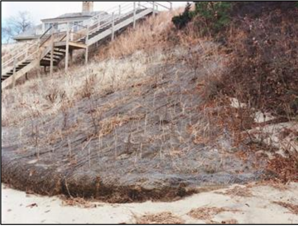
In this bank stabilization project, a natural fiber blanket was installed on the face of the bank and vegetation was planted through it. A coir roll was also installed at the base of the bank.

For important instructions on using plants in bioengineering projects, see the StormSmart Properties Fact Sheet 3: Planting Vegetation to Reduce Erosion and Storm Damage . This fact sheet includes specific information on how vegetation reduces erosion and storm damage, tips on maximizing the effectiveness of vegetation projects and minimizing impacts, specifics on project design and implementation, and instructions on selecting, properly planting, and caring for appropriate species.