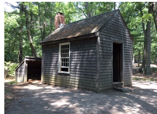
Visit a replica of the house built by Henry David Thoreau