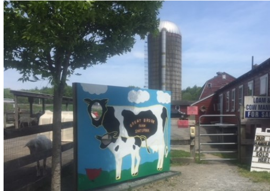
Your kids will love this head-in-the-hole photo op, plus an ice cream nearby!