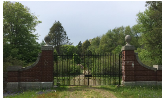
This beautiful black iron gate was the entrance to the Moseley family estate