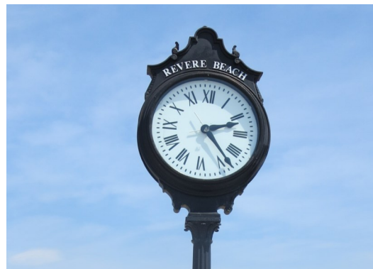
Find this beautiful clock at the country’s first public beach