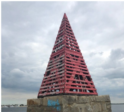
This is known as the “toothpick” on the Merrimack River—used for navigational purposes