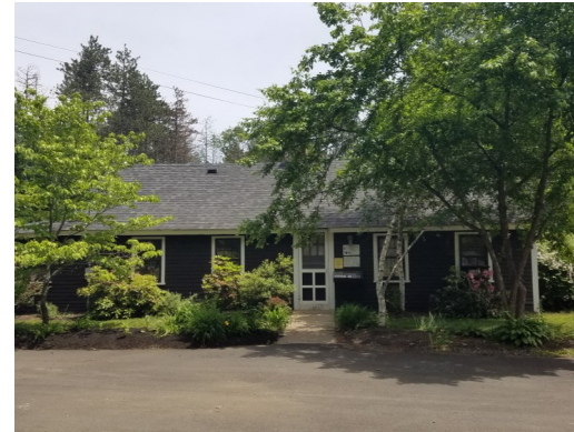
This headquarters building was constructed by the Civilian Conservation Corps