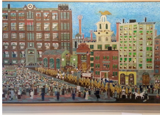
Exquisite labor painting by Ralph Fasanella