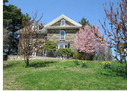
1849 mansion built on the shores of Spot Pond, part of the Wyoming Estates