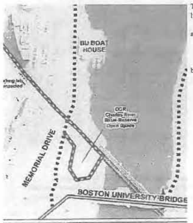
Option 2: Trail with Bus Rapid Tra Section 1: Charles River to Ft. Washington

The area which is animal habitat is bounded by the BU Boathouse on the north and the BU Bridge on the south, and by the hashed line to the left and the Charles River to the right.