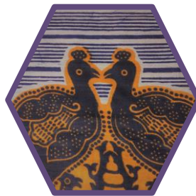
Fabric with bird design