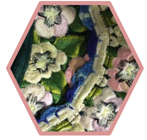
Purse made from a woman's shirt from Guatemala