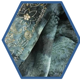
Silk sari with embroidery from India