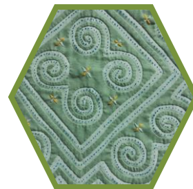
Embroidery and applique needlework by a Hmong artisan