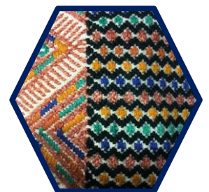
Cotton woven fabric from Guatemala