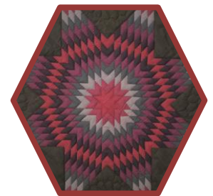
Quilt from United States of America