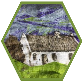
Linen tea towel from Ireland