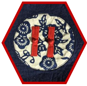
Fabric dyed with indigo from China