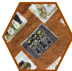
Tote bag from Kenya