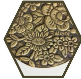
Carved wooden box from Russia