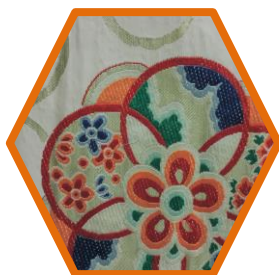
Silk obi belt from Japan