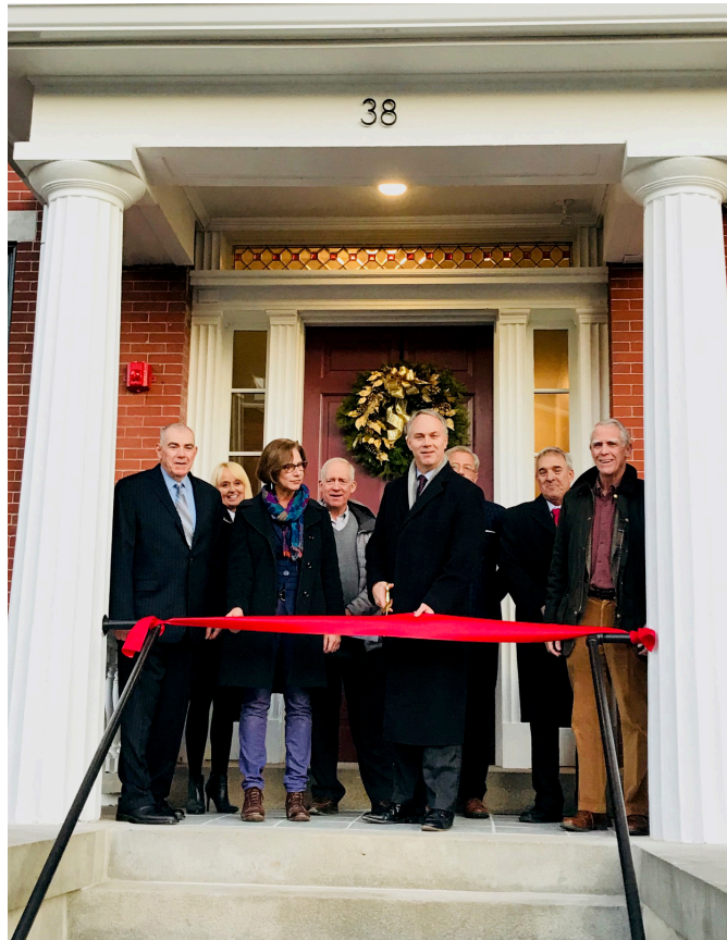
Howland House ribbon cutting in December 2017