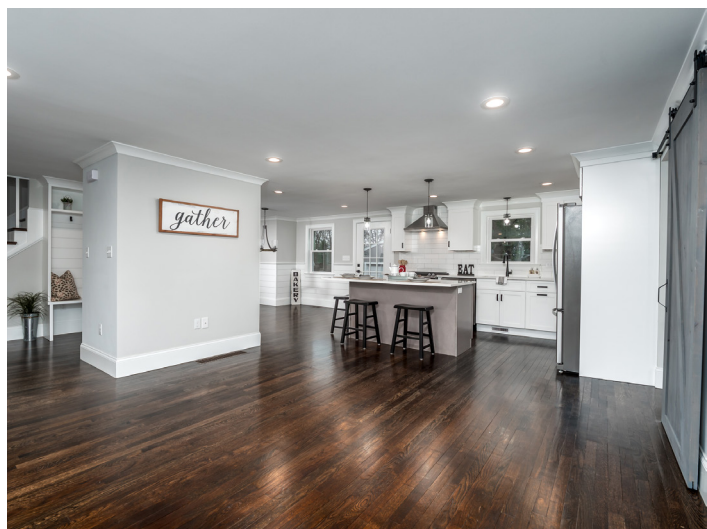
Interior design to "MB Buliung Designs"