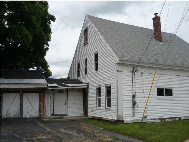
Ambulance view pre-demolition

Vacant for several years, the house located at 1911 Main Street in Athol was deteriorating rapidly. More pressing, however, the house itself was blocking the view of emergency vehicles as they exited the hospital next door and entered oncoming traffic. As part of its efforts to improve medical access in this underserved area and to improve safety around the hospital, the Town of Athol sought assistance from the Attorney General's Office through its grant program. Using a grant of $11,500 from the Strategic Demolition Fund, the Town demolished the dilapidated house, improving critical sightlines for emergency vehicles and making the entire area safer for the community.