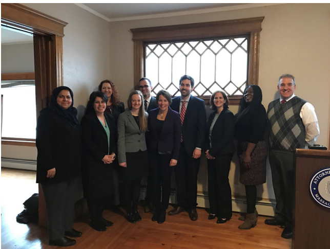
AHI Team on Lincoln Street, Worcester in March 2017