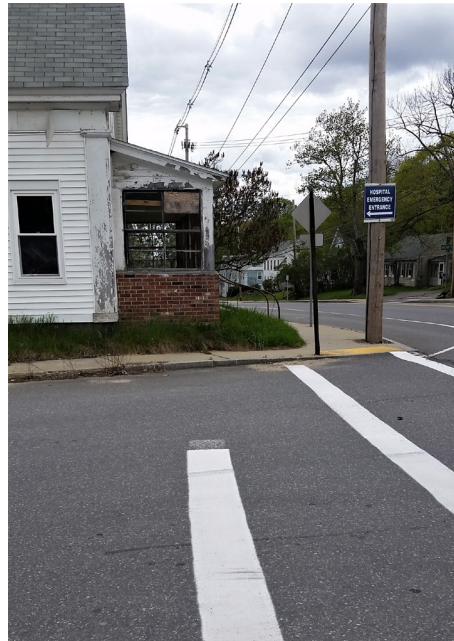
Post-demolition view to the hospital.