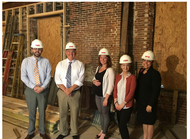
Members of the AHI Team, mid-renovation July 2017