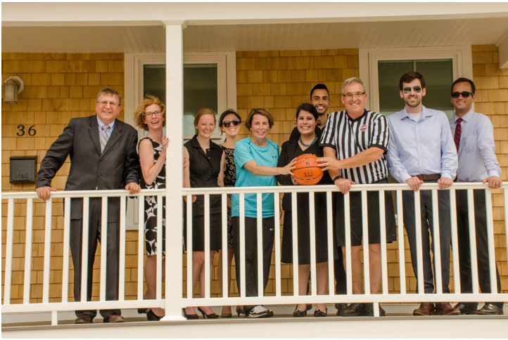
AHI Team on Liberty Street, New Bedford in July 2015