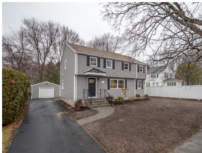
Courtesy of "The Buliung Group Realty" / Interior design to "MB Buliung Designs"