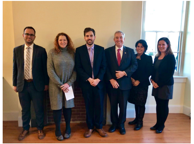
Members of the AHI Team at Howland House grand reopening in December 2017