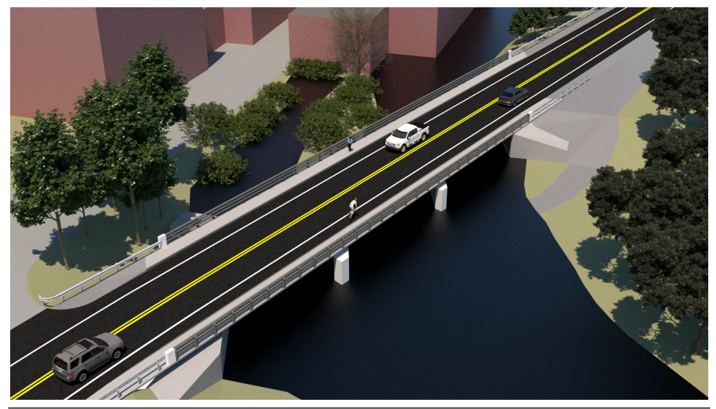
FIGURE 2: Proposed Bridge (Aerial View)