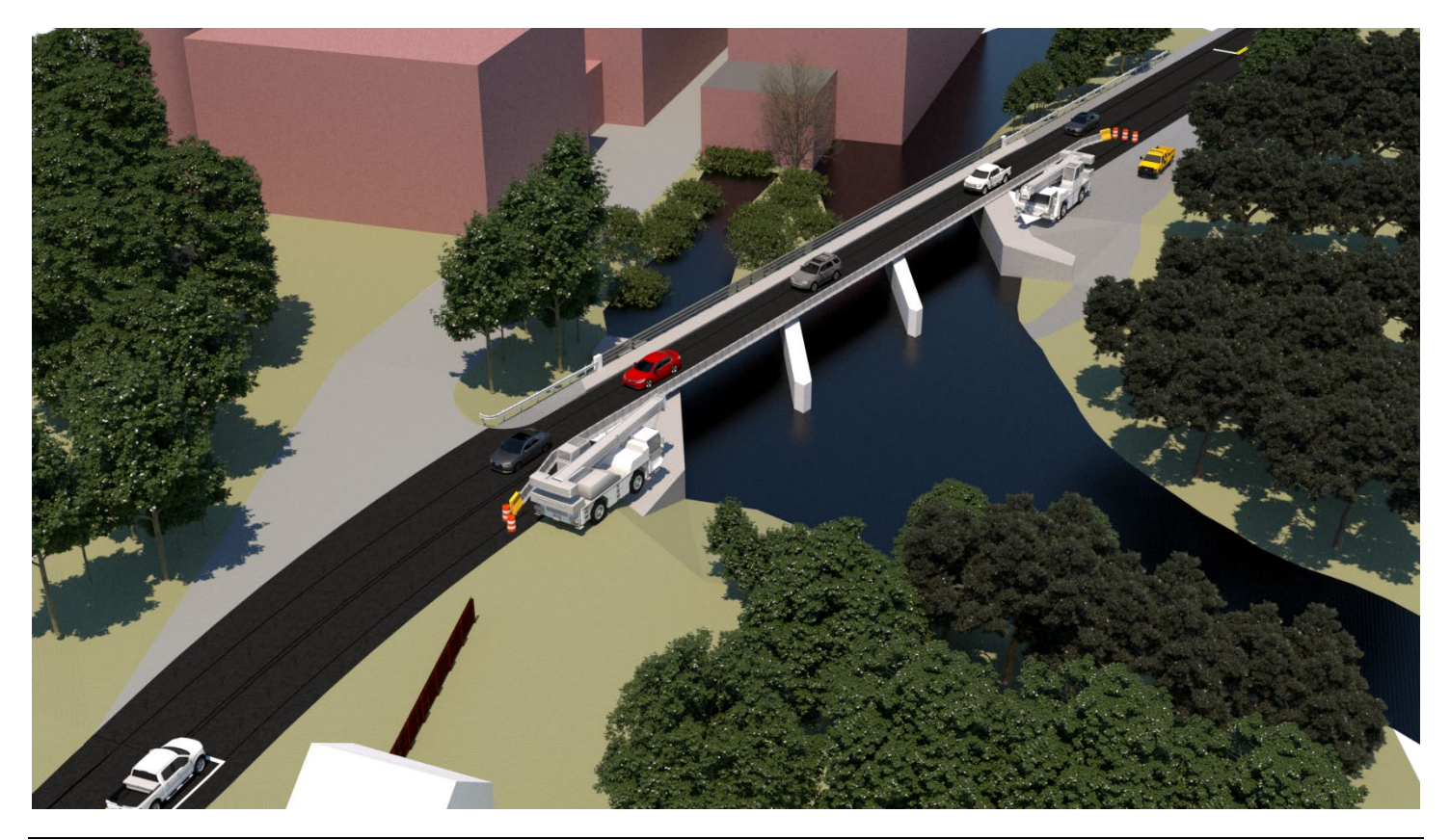
FIGURE 4: Proposed Construction Phase 1