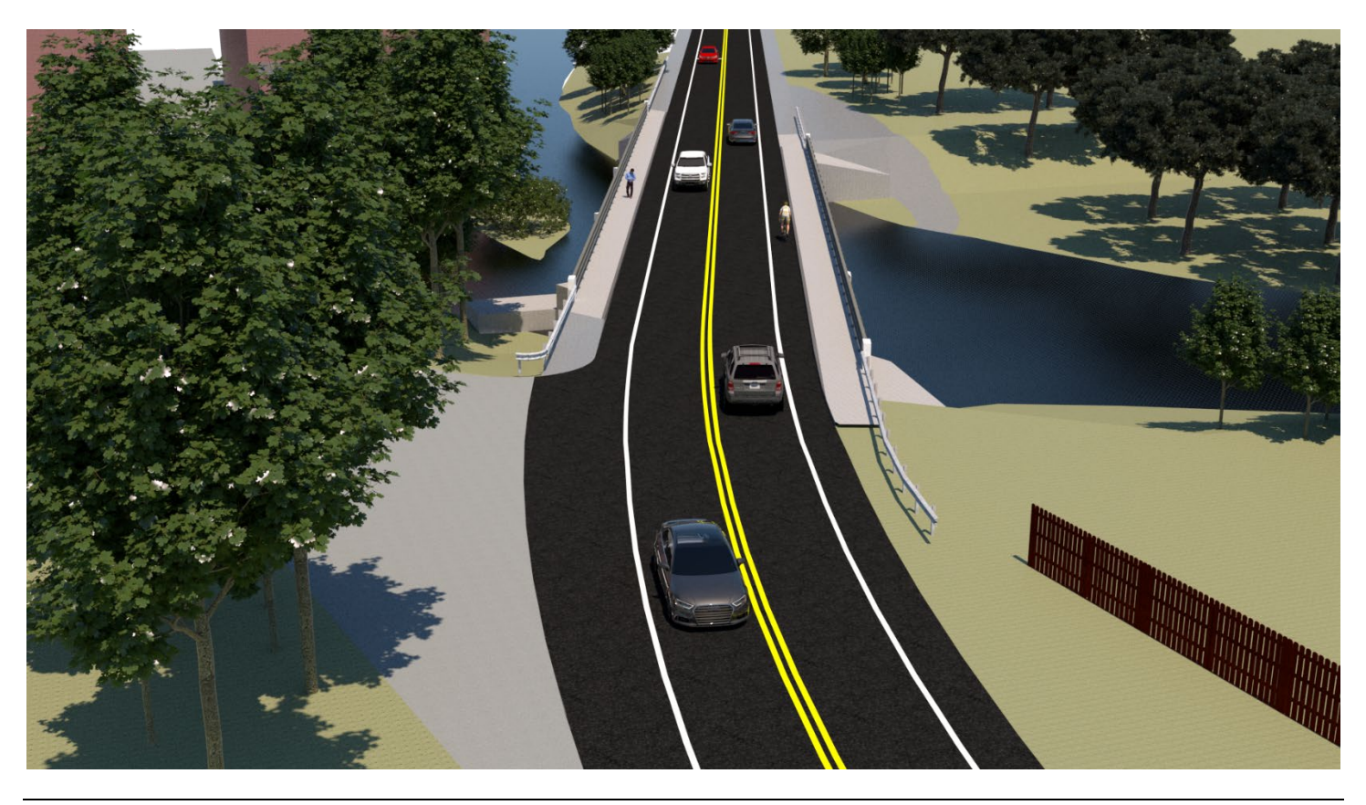
FIGURE 3: Proposed Bridge (looking north)