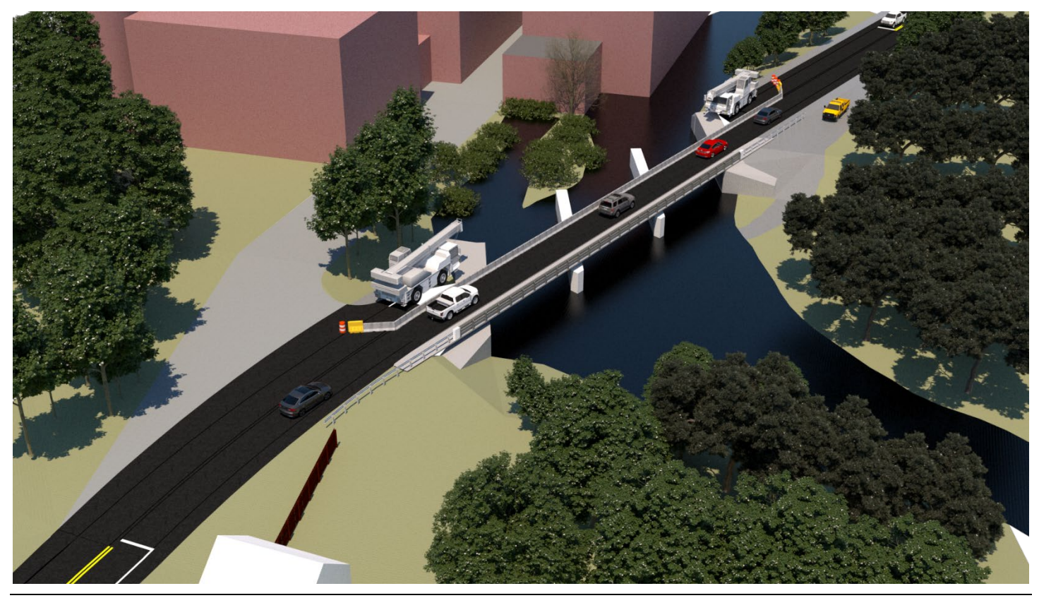
FIGURE 5: Proposed Construction Phase 2