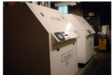
High-Efficiency Condensing Natural Gas Boilers

In addition to the 5,000 gallons/day conserved through the closed-loop cooling water system, Blackinton also modified their wastewater treatment system to incorporate the use of a vacuum distillation unit. The technology recovers distilled water from the wastewater that can be reused in the plating process. Concentrated dissolved salts from the distillation system are dried and disposed of as a hazardous waste. This technology along with modernizing the plating line conserved 20,000 gallons of water per day and reduced sulfuric acid and sodium hydroxide use by an additional 25 percent. Blackinton also switched to magnesium hydroxide for all pH adjustment, which is safer and less toxic to use than sodium hydroxide. The company generates approximately six tons of hazardous waste per year from the enclosed evaporator, down from the 35 tons per year generated from the previous conventional flow-through wastewater treatment system – a reduction of 58,000 pounds of hazardous waste per year.