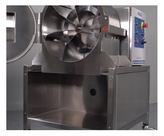
Figure 4 – Impeller and collection area, bin removed