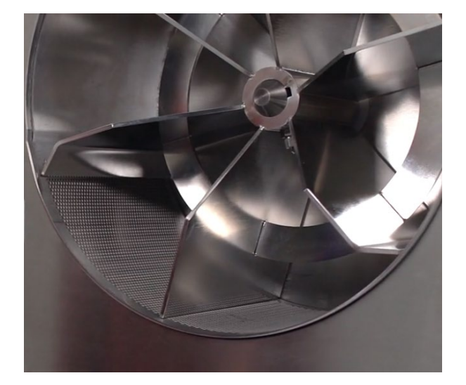
Figure 3 – Impeller and milling screen