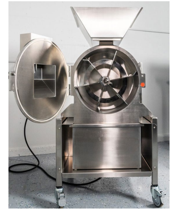
Figure 1 – Grinding machine