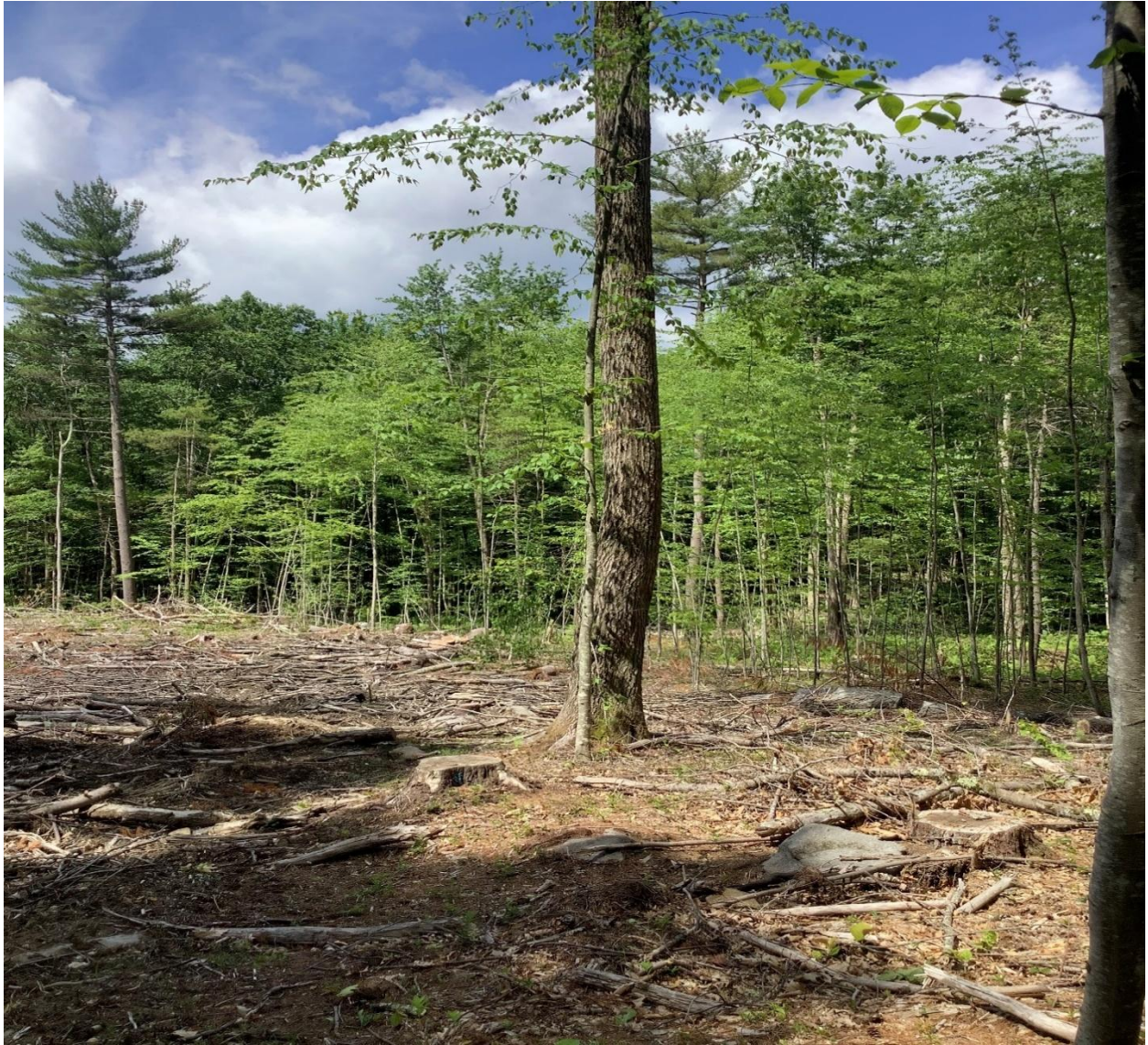
A. Large red oak retention with diverse hardwood regeneration in the understory.