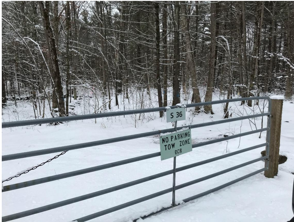
A. Landing location on Justice Hill Road in Sterling.