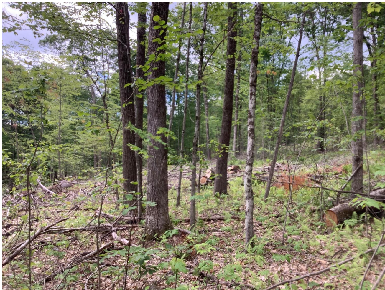
B. Mixed oak and maple retention with diverse hardwood regeneration in the understory.