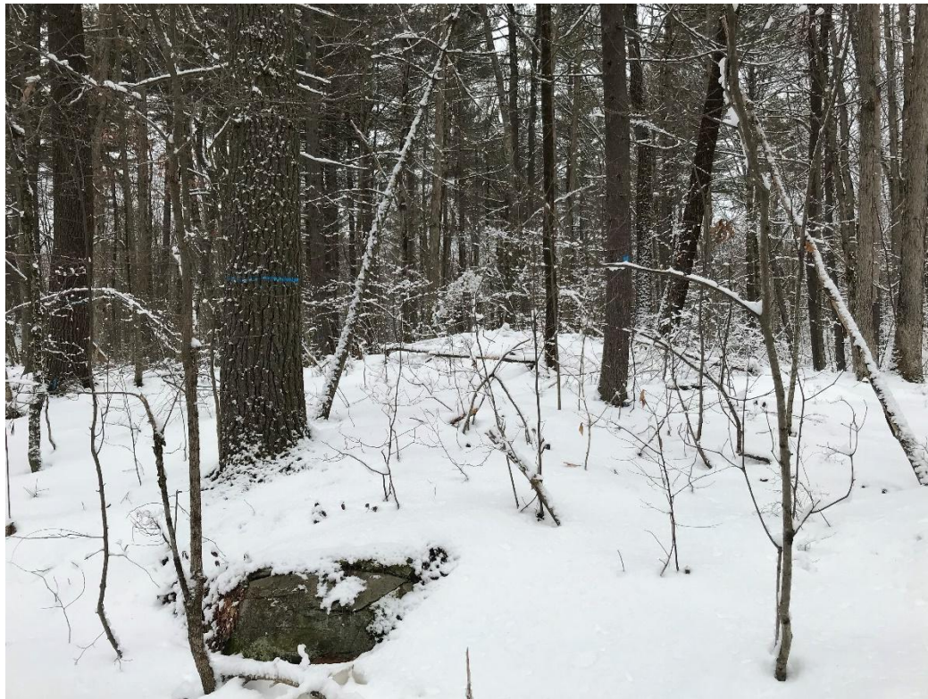
B. An area where the overstory is being removed to release the young seedlings and saplings.