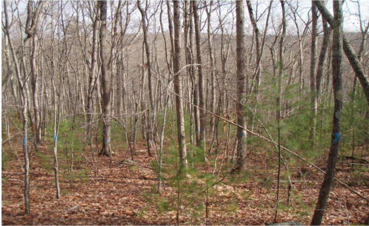
A: Planned canopy opening on the northeast side of the project area, Nov. 2014