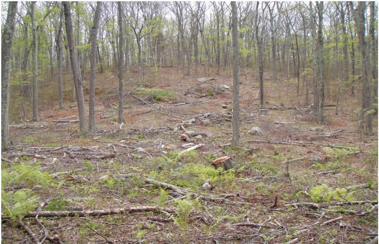
B: Post harvest, June 2017