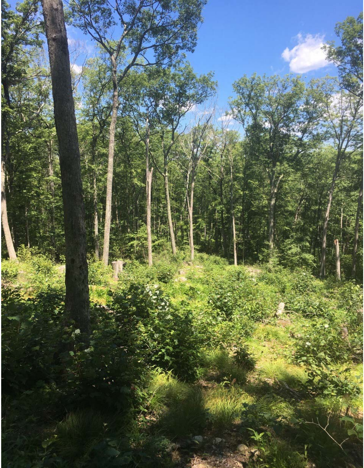
A: After one year of growth July 2018