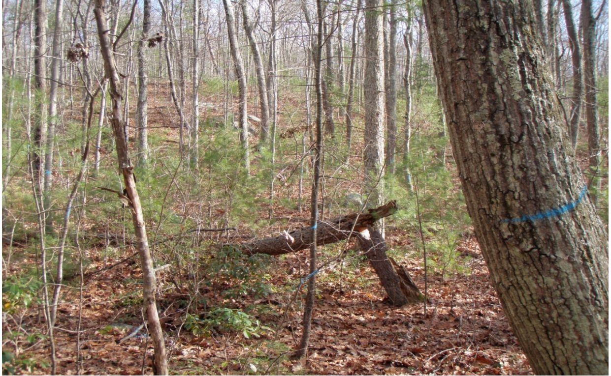
B: Planned canopy opening at foot of slope on the west side of the project area, Nov. 2014