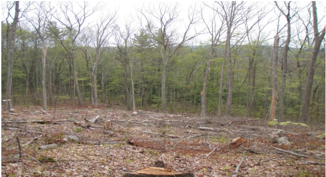
A: Post harvest, June, 2017