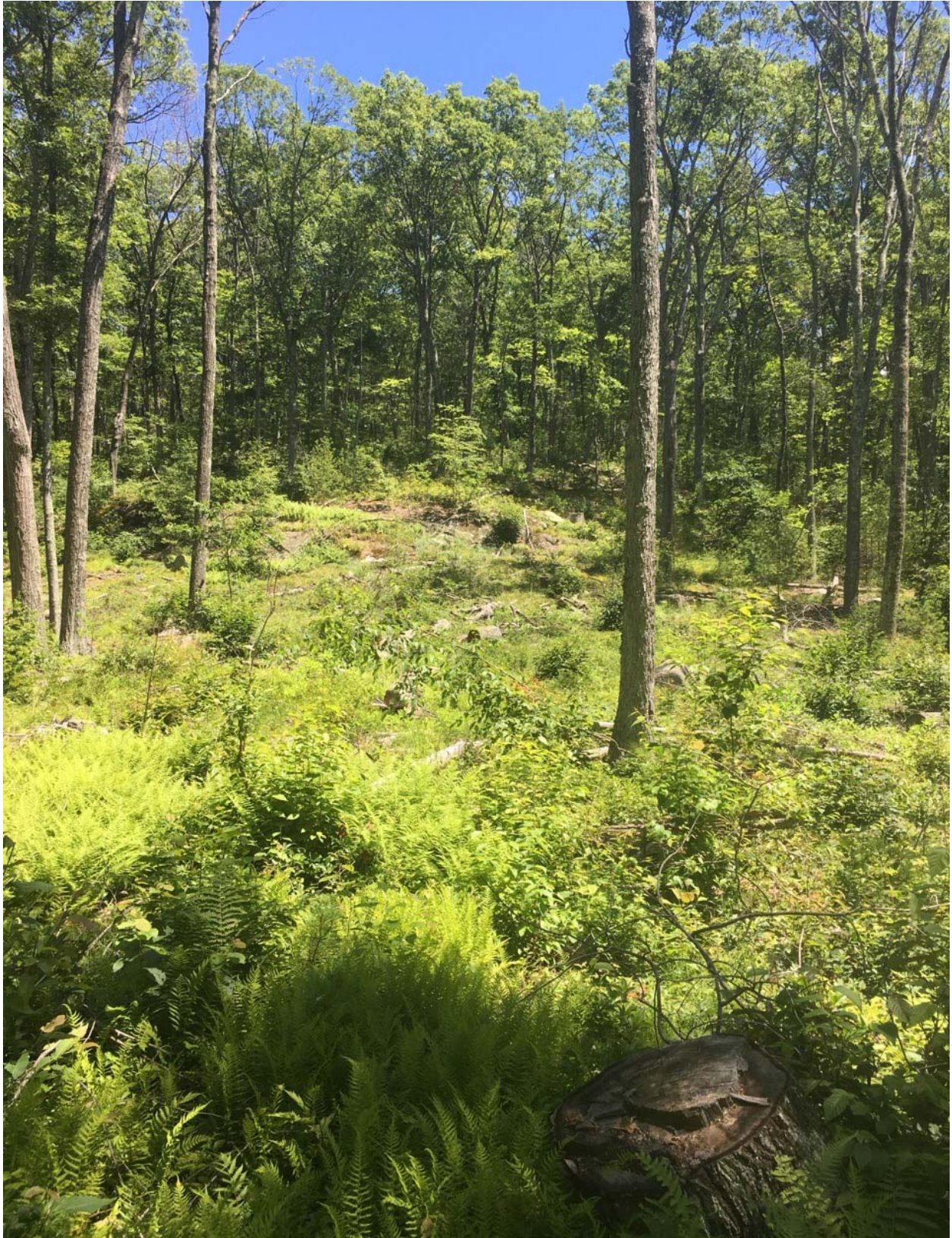
B: After one year of growth, July 2018