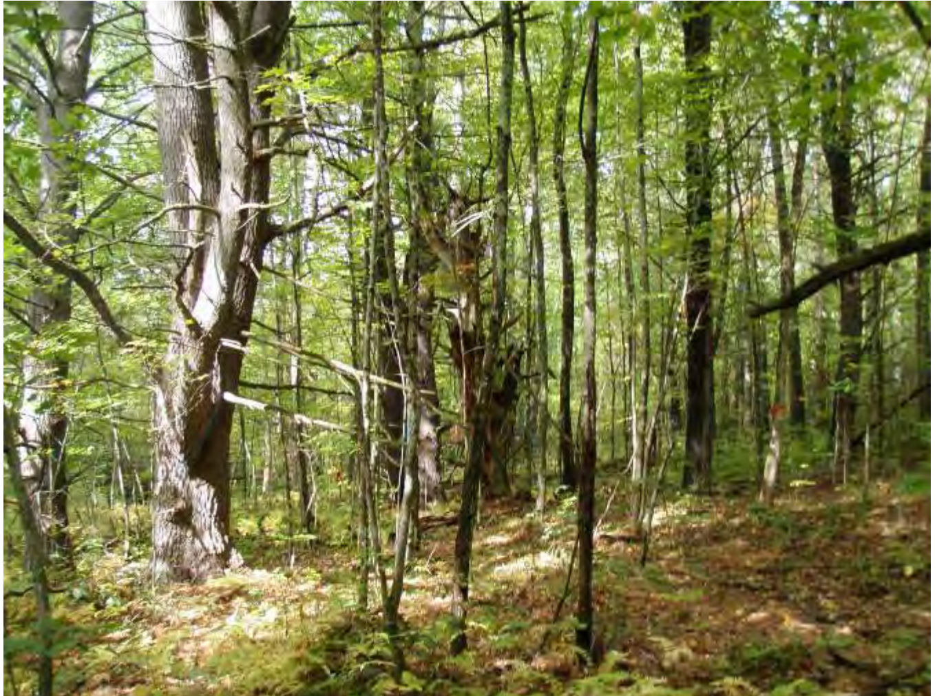
A. Point 1 taken 9/27/16