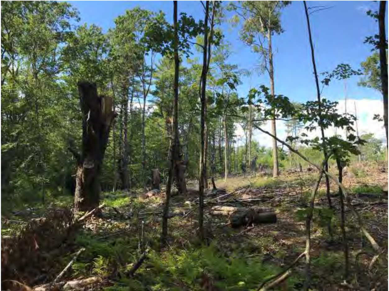
A. Point 1 taken 8/19/20