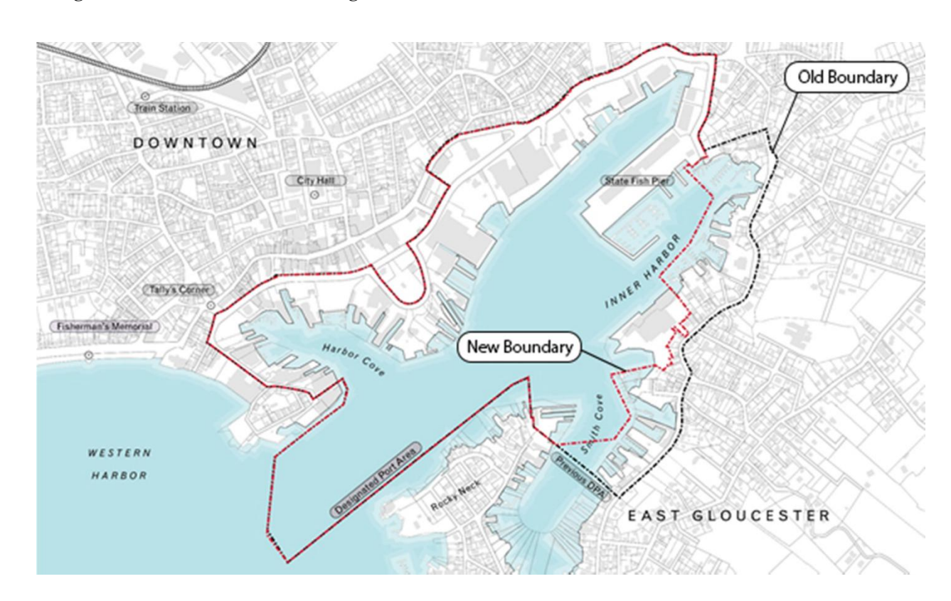
Figure 2. Gloucester DPA