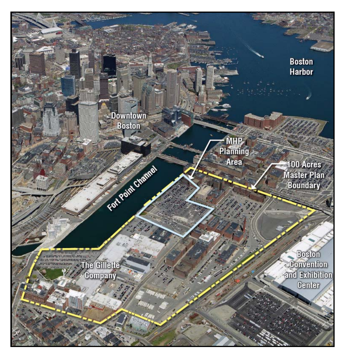
Figure 1. South Boston Planning Area