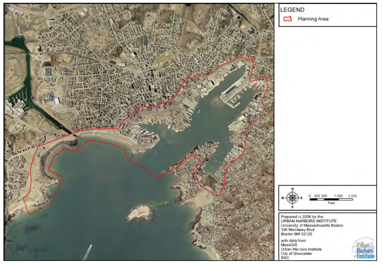
Figure 1. Gloucester Harbor Planning Area

The 1999 Gloucester Harbor Plan was primarily focused on infrastructure improvements for both maritime and visitor-oriented industries along the waterfront as a means of recharging the harbor economy. The 2009 renewal continues to support traditional port improvements while also seeking to provide expanded opportunities for redevelopment within the Harbor Planning Area. The 2009 Plan identifies a number of key strategies to maintain support for the important commercial fishing industry in the city, and also encourages improved opportunity for economic development on the harbor. These strategies aim to streamline regulatory review, stimulate investment, and improve economic conditions along the waterfront.