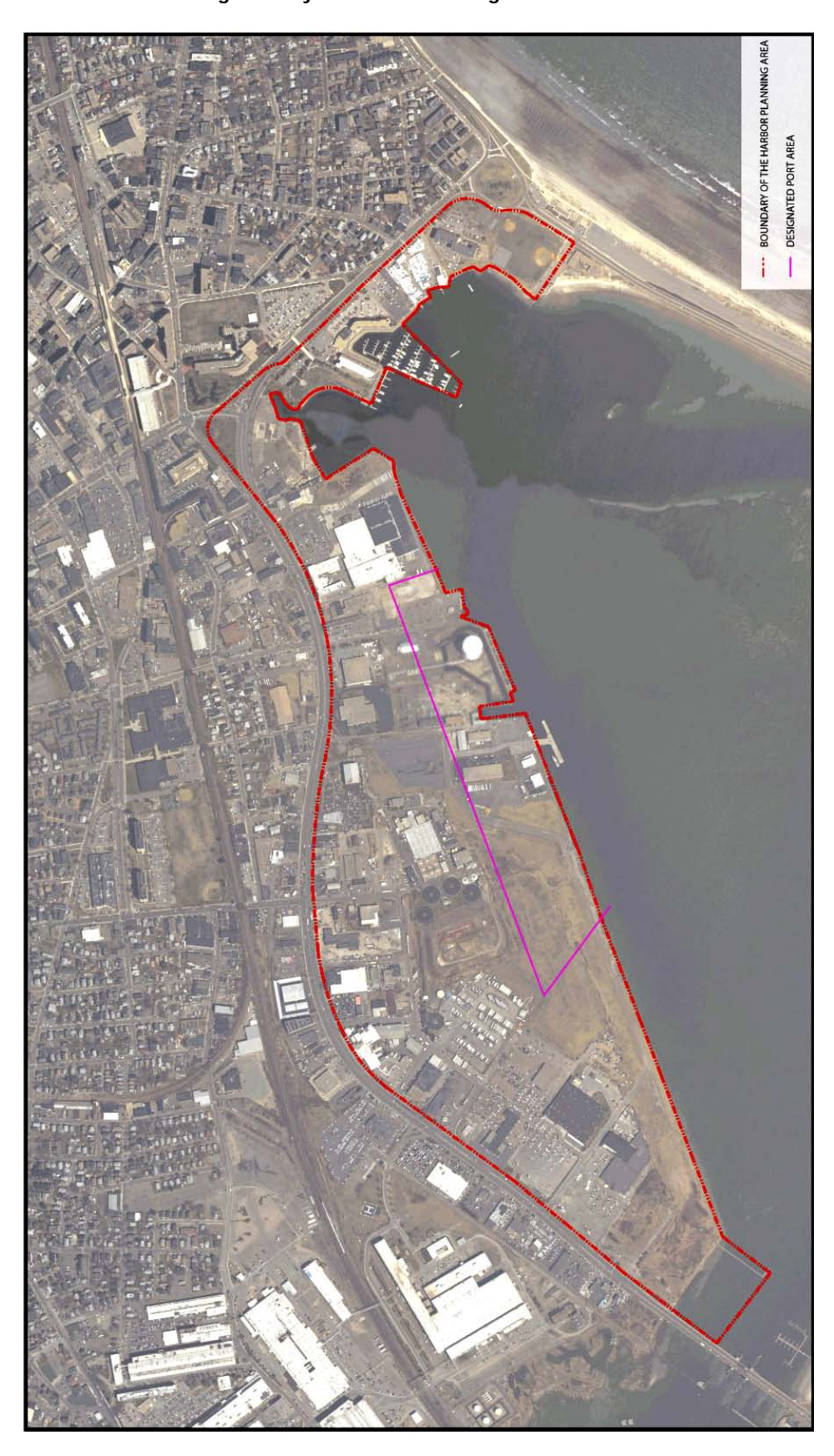
Figure 1. Lynn Harbor Planning Area and DPA