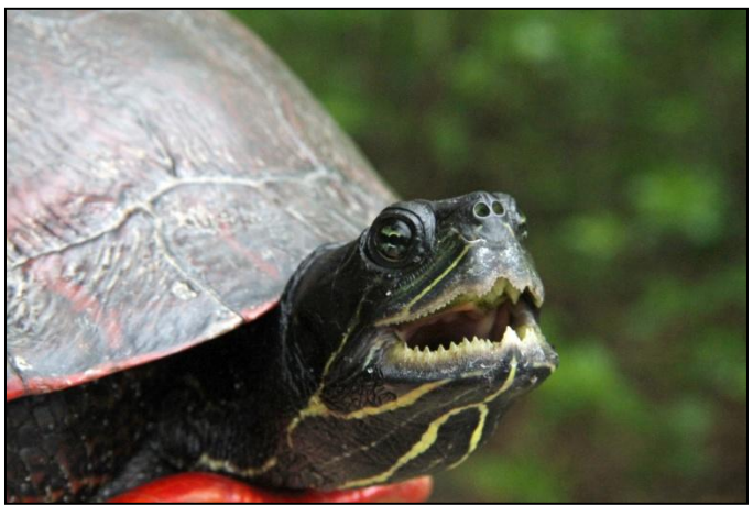
Above: Note the strongly cusped jaws of this adult female Northern Redbellied Cooter.

In some instances, herbicide use in ponds to decrease pond vegetation and the infiltration of herbicides from adjacent cranberry bogs is believed to have altered the Red-bellied Cooter's food source and exposed it to chemical contamination. These impacts combined with the species' late maturation age and low rate of reproduction (less than one-third of females reproduce yearly) have made it difficult for the Red-bellied Cooter to thrive. Hatchling mortality is very high for this species, with intense predation on the eggs by skunks and raccoons (which increased in population size as residential areas increased) destroying as many as half of the Red-bellied Cooter's existing nests. Bullfrogs, water snakes, wading birds, and predatory fish such as pickerel and bass feed on hatchling turtles.