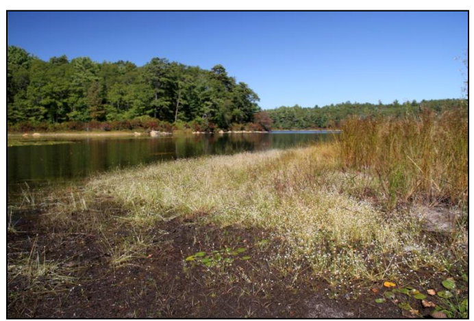
Above: Exemplary coastal plain pond habitat of the Northern Red-bellied Cooter in Plymouth, Mass.

Massachusetts, the Northern Red-bellied Cooter primarily inhabits freshwater ponds and rivers that have abundant aquatic vegetation and suitable basking sites in the form of logs, rocks, and vegetation mats. Most of the original documented occurrences of Red-bellied Cooters were associated with coastal plain ponds, although they have also been documented in manmade reservoirs and cranberry ponds and introduced to larger lakes and rivers. Red-bellied Cooters nest in exposed sand and gravel, lawns, gardens, and roadsides near ponds and rivers from late May to early July.