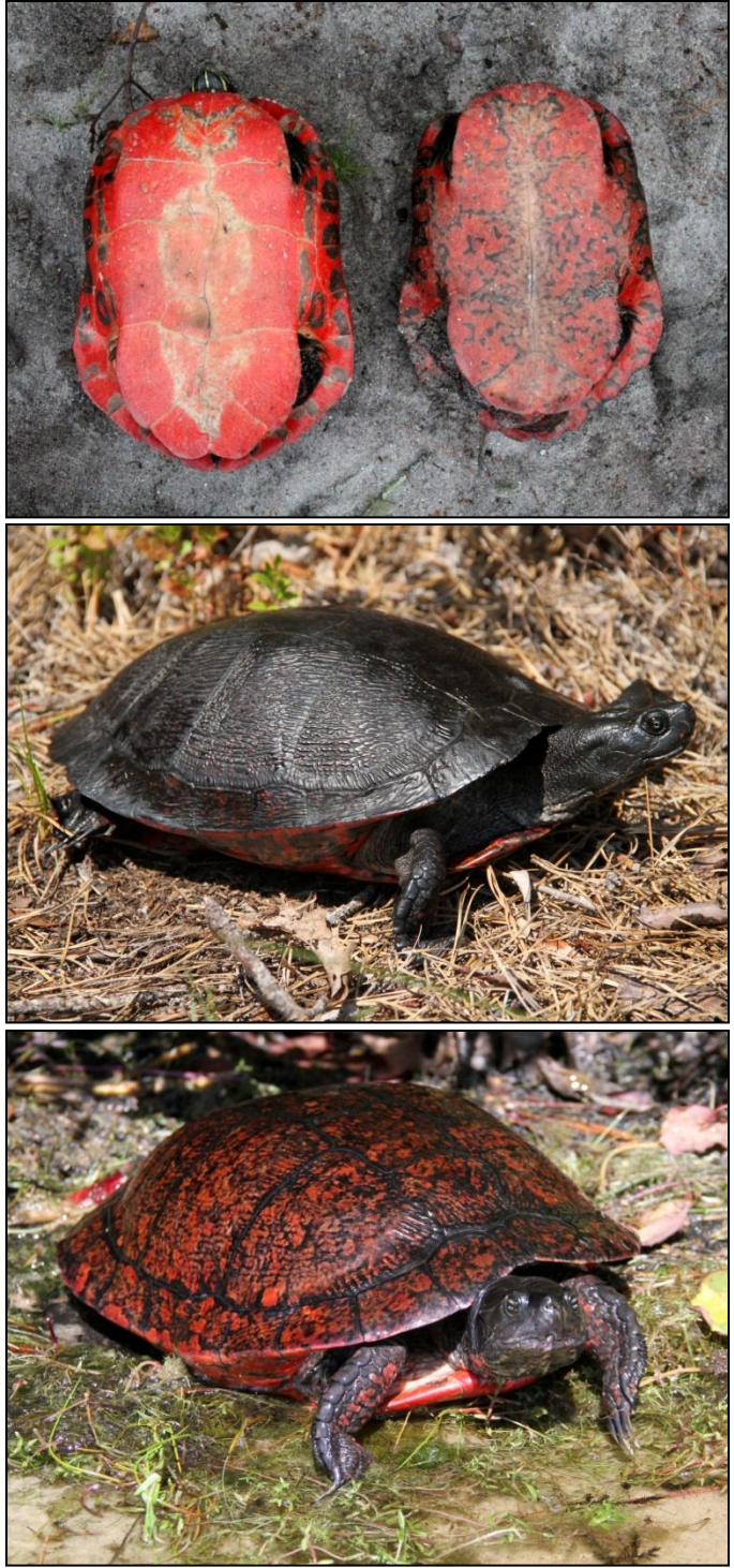
TOP: A comparative photo of a female (left) and male (right) Northern Redbellied Cooter from Plymouth, Mass. Note the pinkish red plastron color of the female and the larger overall size. MIDDLE: Some adult males (such as the one pictured here) become melanistic with age, losing their juvenile coloration. BOTTOM: Occasionally, older males will develop a marbled, salmon-colored carapace.

RANGE: Massachusetts populations of Northern Redbellied Cooter comprise an isolated, disjunct population approximately 200 miles from the nearest populations in New Jersey. In Massachusetts, the species is currently confined to ponds and rivers within Plymouth County and eastern Bristol County. Massachusetts populations were formerly described as a distinct subspecies, P. rubriventris bangsi (Plymouth Redbelly Turtle). The primary range of the Northern Red-bellied Cooter extends from the Coastal Plain of New Jersey south to the Outer Banks of North Carolina, inland to West Virginia in the Potomac watershed. Archaeological evidence from Massachusetts midden sites indicates that prior to European settlement, Red-bellied Cooters occurred as far north as Ipswich, Essex County, as well as in the Sudbury River and on Martha's Vineyard.