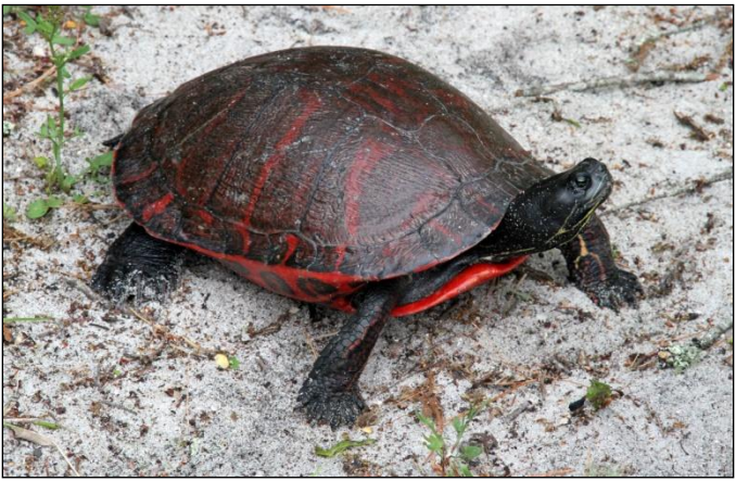
Above: An adult female Northern Red-bellied Cooter from Plymouth, Mass., showing characteristic brownish carapace with red markings.

State Status: Endangered Federal Status: Endangered