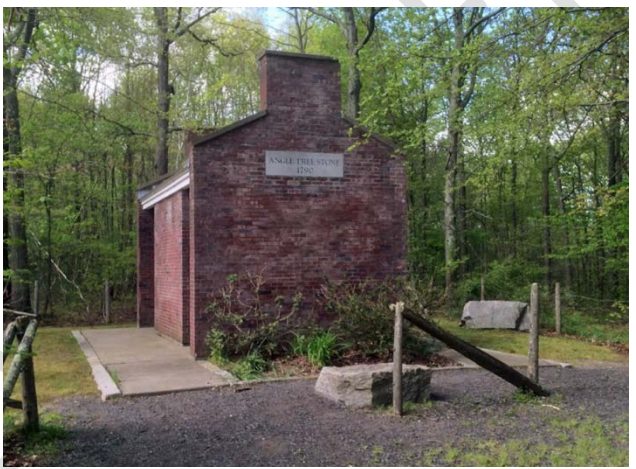
Building at Angle Tree Monument Reservation; spring 2016. (See Appendix K for photo information.)

Angle Tree Monument was placed on the National Register of Historic Places in 1976. In 1981 a brick building was constructed to house and protect the monument. This building is located partially on the Reservation and partially on private land in Plainville. In 2001, the building was cleaned and restored, and the site improved.