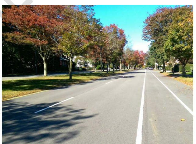
Blue Hills Parkway, Milton. (See Appendix K for photo information.)

There are two connecting parkways partially within the Blue Hills Complex; the Blue Hills Parkway and the Furnace Brook Parkway. Both are associated with the Blue Hills Reservation. Within the Blue Hills Parkway extends Complex, the approximately 1.5 miles from Unquity Road, Milton, northward to the Neponset River. An additional 0.04 miles of parkway is located north of the Neponset River, outside the Blue Hills Complex and within the City of Boston. The Furnace Brook Parkway extends approximately 3.92 miles from Wampatuck Road, at the boundary of the Blue Hills Reservation, to Quincy Shore Drive, Quincy. Only 0.44 miles of the Parkway are within the Blue Hills Complex, which ends at the Southeast Expressway (I-93). Both parkways are historic, and include significant cultural resources. (Table 1.3.1.)