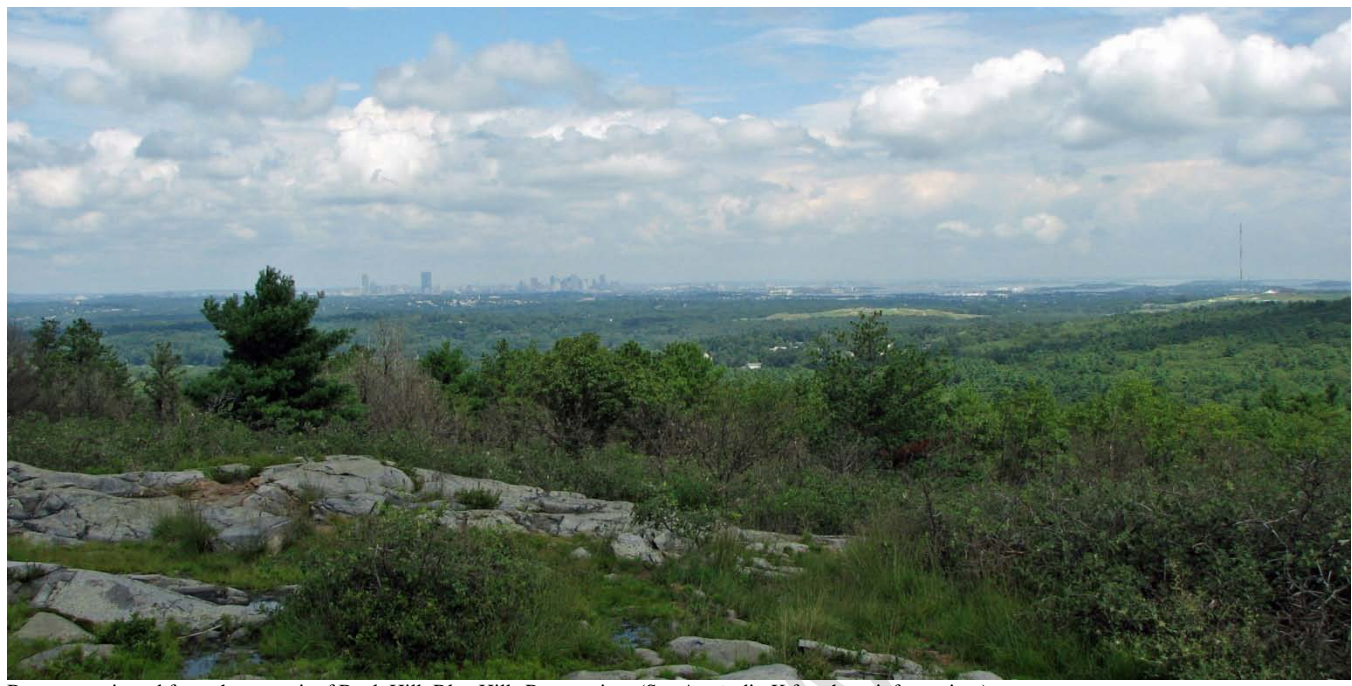
Boston, as viewed from the summit of Buck Hill, Blue Hills Reservation. (See Appendix K for photo information.)