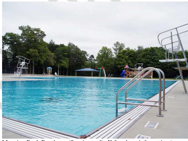
Manning Pool, Brockton. (See Appendix K for photo information.)

between the Massachusetts Department of Public Health (DPH) and the DCR specifies the steps that both parties will take "to facilitate compliance with 105 CMR 435.00: Minimum Standards for Swimming Pools " at all DCR-owned pools, including those not operated by the DCR. The DCR and DPH provide two days of training to municipal pool operators; this consists of one day of DPH inspection training and one day of pool administration and management training. The DCR helps municipalities correct deficiencies identified during DPH inspections by providing Park Support Operations (PSO) personnel to perform corrective measures. The DCR also provides a separate one-day course in pool management.