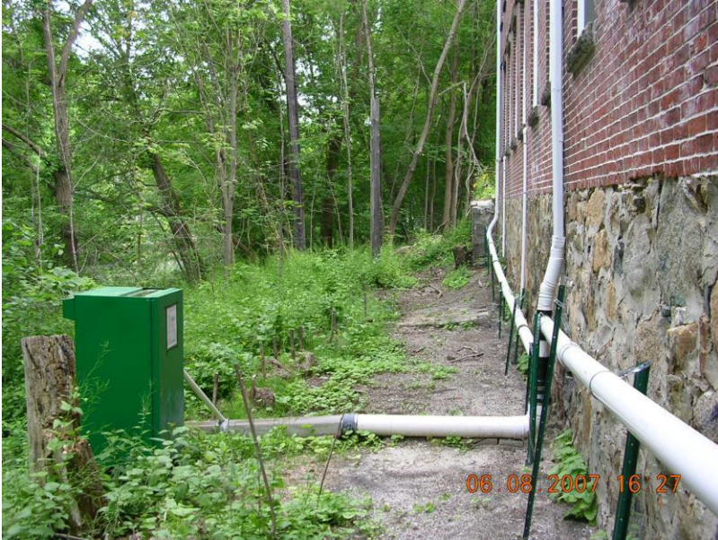
Downspout runoff collection system