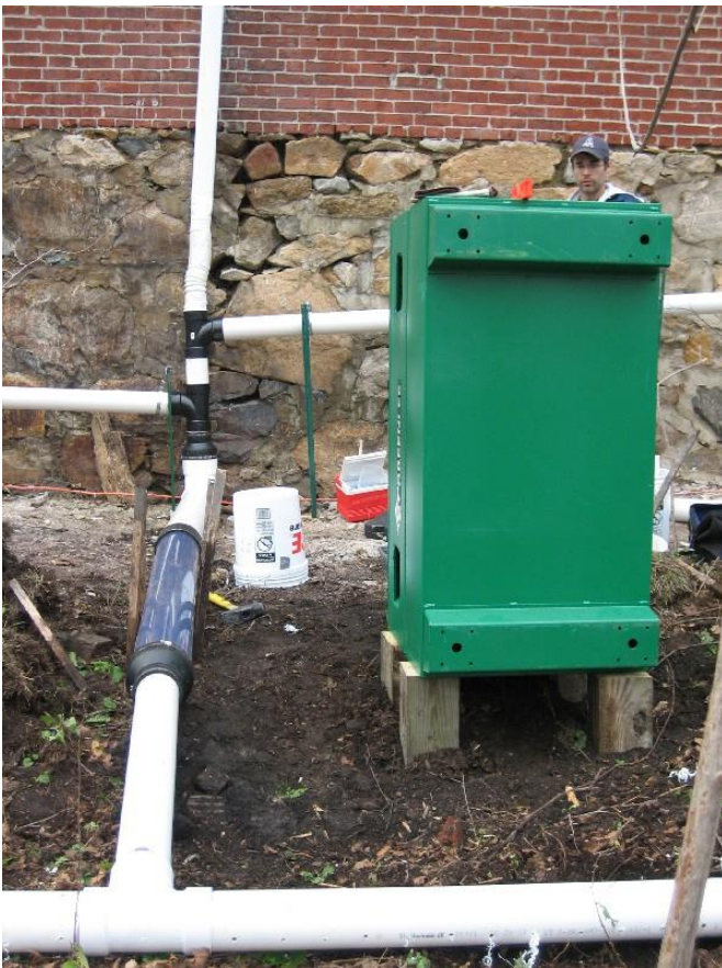
Water quality sampler