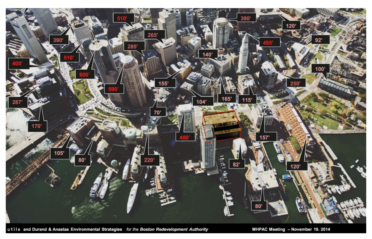
Figure 4: Building Heights of Boston Skyline

Based on my review of the Plan and the shadow studies performed, it appears that there will be net new shadow cast by a project proposed on the Harbor Garage site. If net new shadow is created, it will affect a portion of the ground-level conditions. As part of my review, I must ensure that the plan includes requirements that, considering the balance of effects on an area-wide basis, will mitigate, compensate for, or otherwise offset adverse effects on water-related public interests.