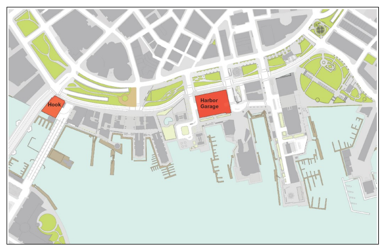
Figure 2. Downtown Waterfront District Municipal Harbor Plan Redevelopment Parcels