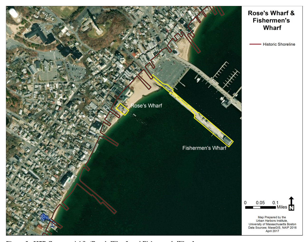
Figure 2. 227R Commercial St (Rose's Wharf) and Fisherman's Wharf