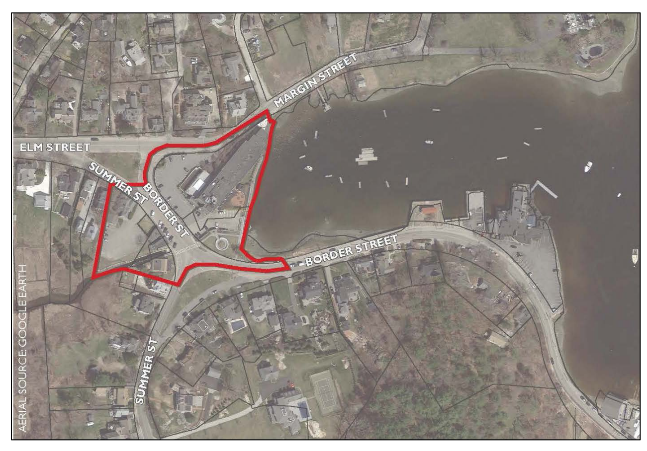
Figure 2. Harbor Village Business Overlay District (HVBOD)